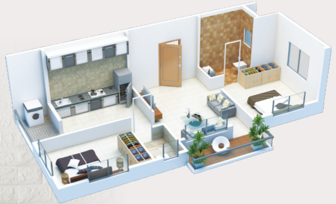
2 BHK ISOMETRIC VIEW